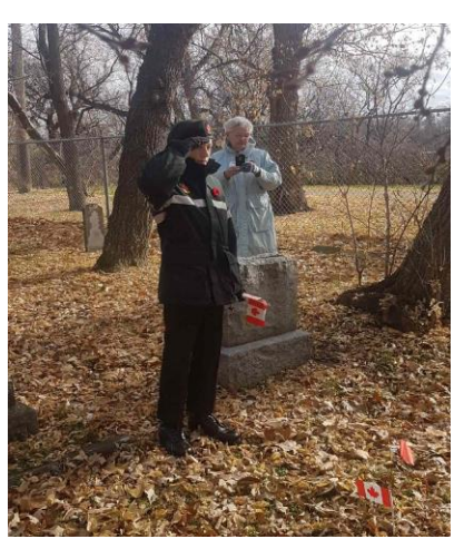
Nov 3, 2018, Cadets of the 2701 PPCLI Cadet Corp, members of St. James Branch No. 4, the Rector and members of the St. James Anglican Church placed Canadian flags on the graves of Veterans from the First World War over the weekend.