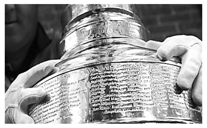
Leafs' challenge: Win the Stanley Cup by 2030 or disappear