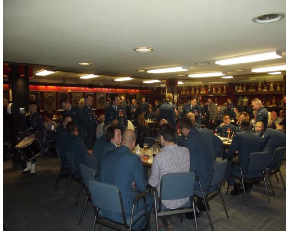
On November 11, At The Going Down Of The Sun, communities across Canada marked the 100th anniversary of the end of the First World War with the ringing of 100 bells. The ringing of bells emulates the moment in 1918 when church bells across Europe tolled as four years of war had come to an end.