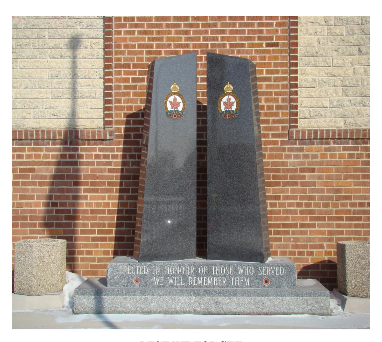
LEST WE FORGET 1755 PORTAGE AVE, WINNIPEG MB. 888-2860