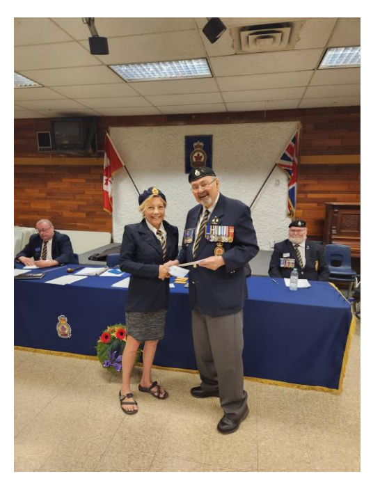
Legion 4 Sick Visiting $1000.00