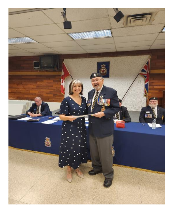
Dear Lodge Foundation $8000.00