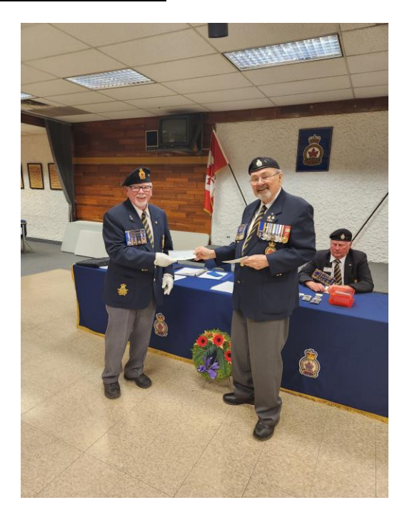
Legion Memorial Housing $5000.00