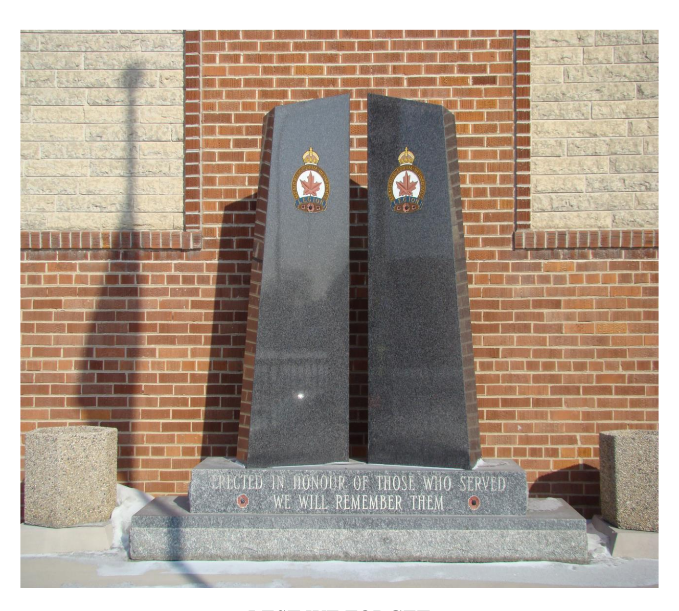
LEST WE FORGET 1755 PORTAGE AVE, WINNIPEG MB. 888-2860