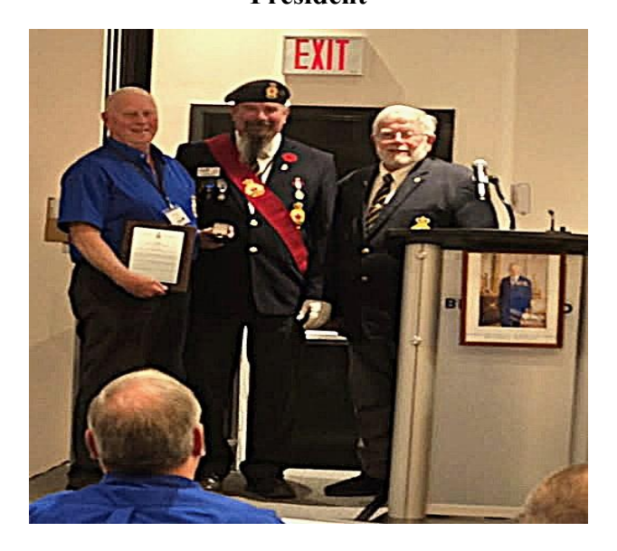
Poppy Fund Donations June 19th